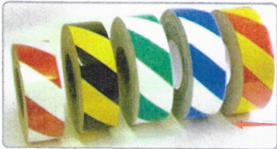
right direction stripe reflective sheeting

This is a cost efficient Reflective Sign Sheeting or Reflective Tape . It is unprintable Commercial Grade Reflective Sheeting (but we can print with double color stripes in house as shown below). If you need the same grade cheap reflective sign vinyl to be printable by screen or HP latex printers , please switch to check our high quality H3200.