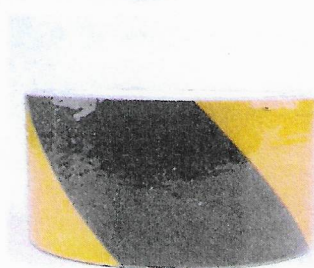
Single shrink packing